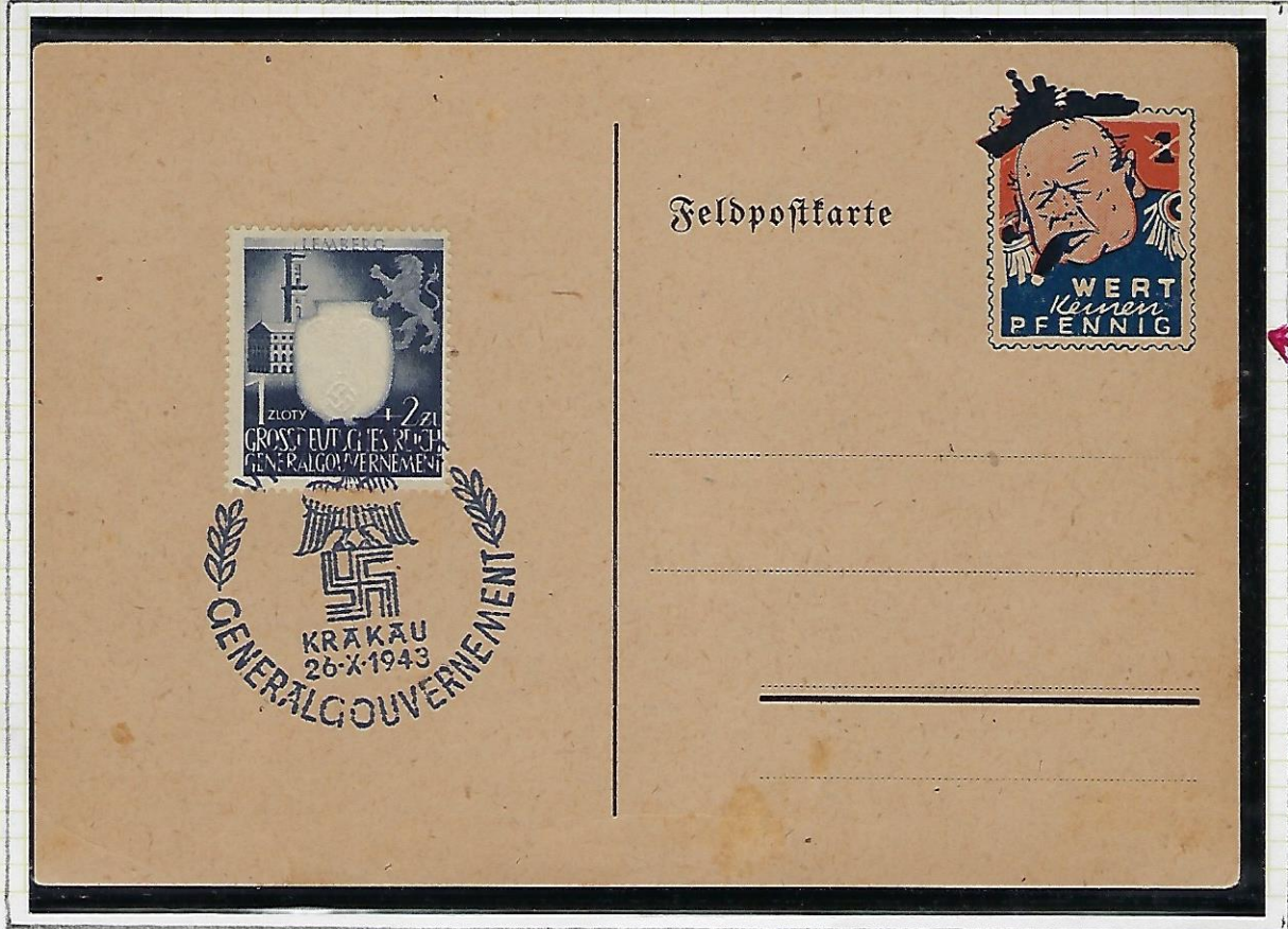
Pre-printed "stamp" showing Winston Churchill carrying his sinking Navy, "WERT keinen PFENNIG" ("Value not a single Penny"). Field post card, cancelled Berlin (these cards were first sold in Germany proper, then also in occupied lands).